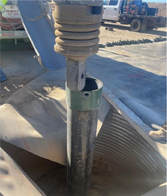
The second of six wells approved for drilling is now prepared for the main drilling rig.